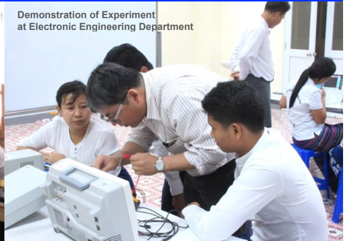
Demonstration of Experiment at Electronic Engineering Department

EEHE Project conducted the Staff training in Yangon Technological University (YTU) for one week from 15th May. Seventeen (17) experts from Japanese Supporting Universities namely Chiba, Niigata, Kanazawa, Okayama, Nagasaki and Kumamoto universities were dispatched under the Departments of Mechanical, Electrical power, Electronic, Computer Engineering and Information Technology and Mechatronics Engineering.