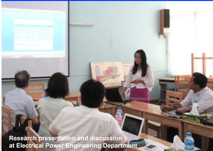
Research presentation and discussion at Electrical Power Engineering Department