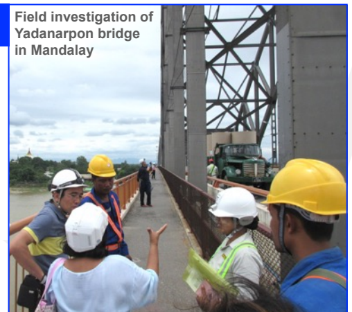
Field investigation of Yadanarpon bridge in Mandalay